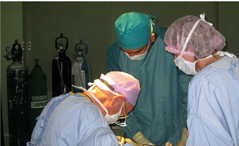
Plastic surgery project october 2009