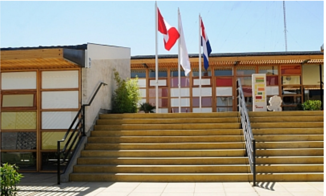
entrance of the children's hospital

Today, July 2010, the local government has come to a solution to fulfill their promise and it is expected that the hospital can be put into use in the fourth trimester of 2010 and be operational as from the first of January 2011.